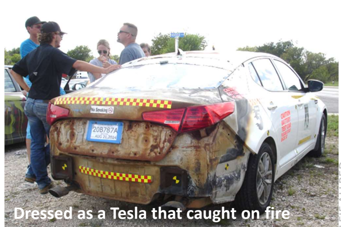
Dressed as a Tesla that caught on fire

Apparently, this is also an annual scavenger hunt that departs from Martin’s Rod and Custom in Lampasas to the Grand Canyon and back in a vehicle that cannot cost more than $500. Talking with a participant, they can make the car safe (tires, brakes) and can then spend $500 on engine upgrades before embarking on the race while gathering video evidence of 6 challenges. The 7 th challenge was drawn from a hat: roadkill. Most applauded that it was a photo holding it and not bringing it back as was done before. The vehicles are hilarious!