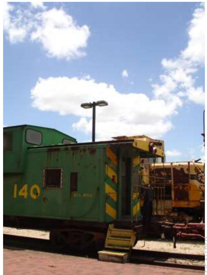
Temple, TX – Railroad & Heritage Museum

For those who wake up early or live close by, this tour of the northern area will have an 8:00am meet-and-greet at Pistons-on-the-Square in downtown Georgetown. We'll then gather and depart Georgetown around 10:00am for a back roads tour towards Salado to visit a member's exclusive collection and on towards Temple to the Railroad & Heritage Museum followed by lunch. The tour may then cruise through Belton's antique stores.