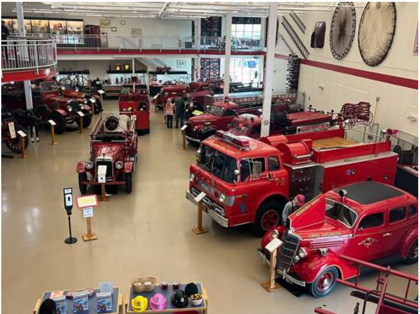
Michigan Firehouse Museum – Ypsilanti, MI

The REO Club has close ties to the Olds Museum, and it was fitting for the 50 th club meet to devote most of a day to it. It showcases a diverse collection of Oldsmobiles dating from 1897 to 2004. Of course, it includes a number of REO cars and trucks from the company R. E. Olds formed after →