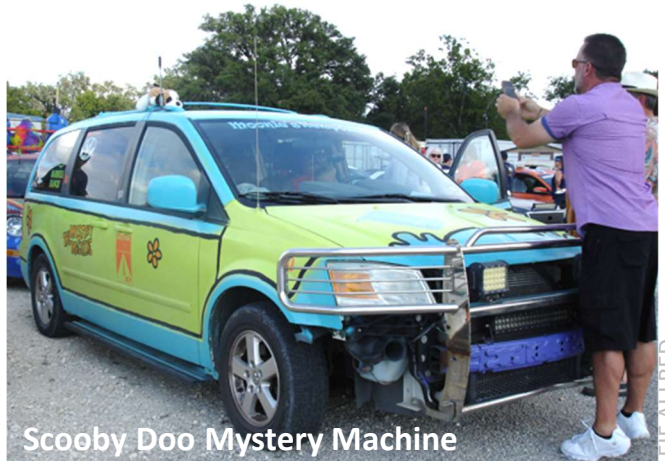
Scooby Doo Mystery Machine