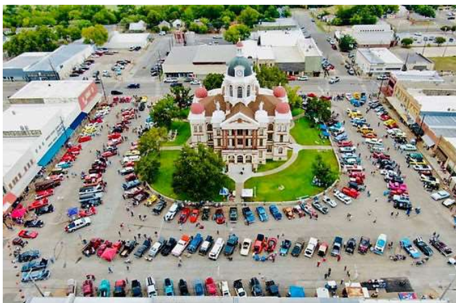
Gatesville, TX – Seat of Coryell County