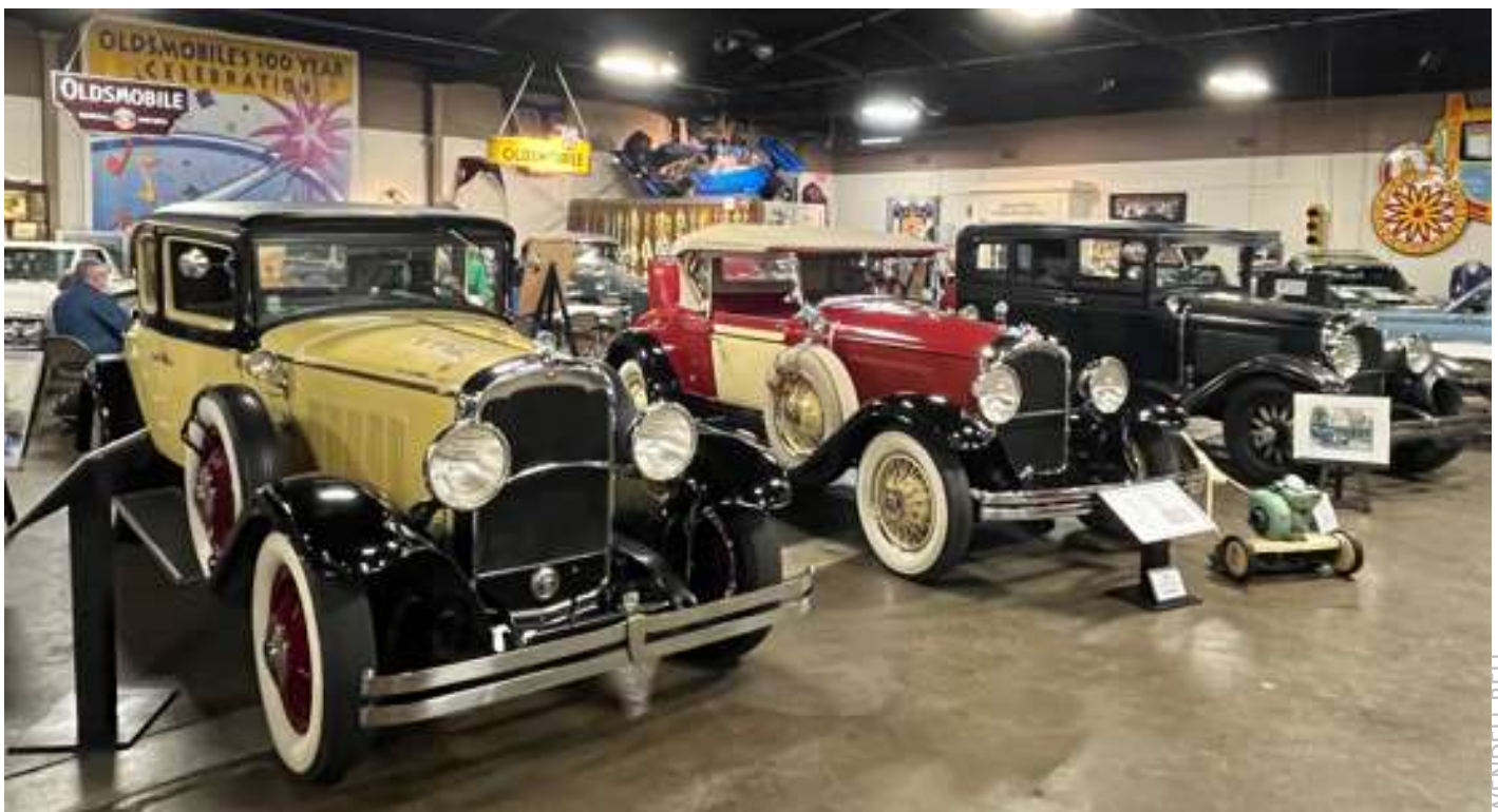
R.E. Olds Transportation Museum – Lansing, MI

Next, we drove about 8 miles to the Ypsilanti Automotive Heritage Museum housed in a building that was a Hudson dealership until 1958 when that line was discontinued. With a focus on the Hudson-Essex-Terraplane vehicles, the museum tells stories of other automotive products with ties to Ypsilanti and the Willow Run manufacturing complex such as the Chevrolet Corvair and the Hydramatic transmission. The museum also houses a Kaiser-Frazer archive with several examples of their vehicles. →