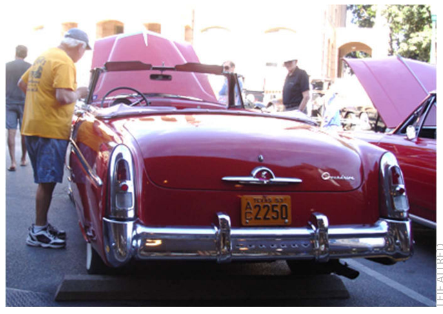
1953 Mercury - Georgetown, TX - August 17, 2024

If I wanted to take a photo of a car without people in the frame, I would put it somewhere away from people. I love getting shots of people poking their faces in the window, under the hood, or lying on the ground to see under it. Antique cars are good to study for aesthetics, design, and restoration details. The other fun thing to do is take photographs of other people taking photographs of unique features or of their people posing in front of it. How did the car become so photogenic? Leif