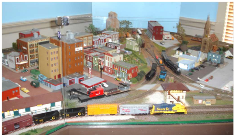
Temple Railroad & Heritage Museum