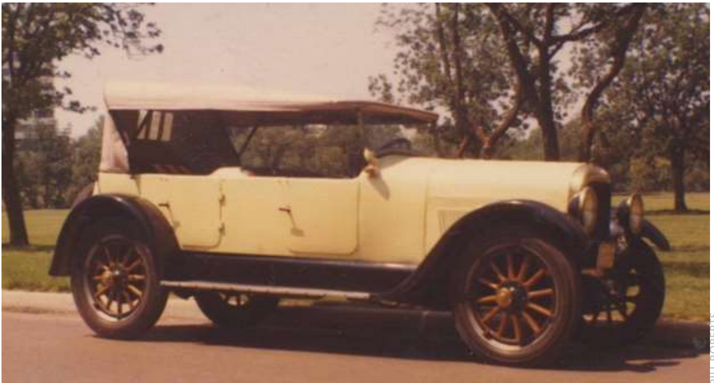
1918 Paige Model 6-55 Larchmont four-passenger touring car – https://wcroberts.org/Paige.htm

My Paige last ran in 1972 but the engine no longer turns. The car is on jack stands but the tubes and tires have deteriorated. It is still on a 6-volt battery. Please let us know if you are aware of a mechanic or shop in San Antonio (or neighboring cities – including Austin or Houston) that would take on the project of getting this car running again. Please email to FenderTalk@outlook.com .