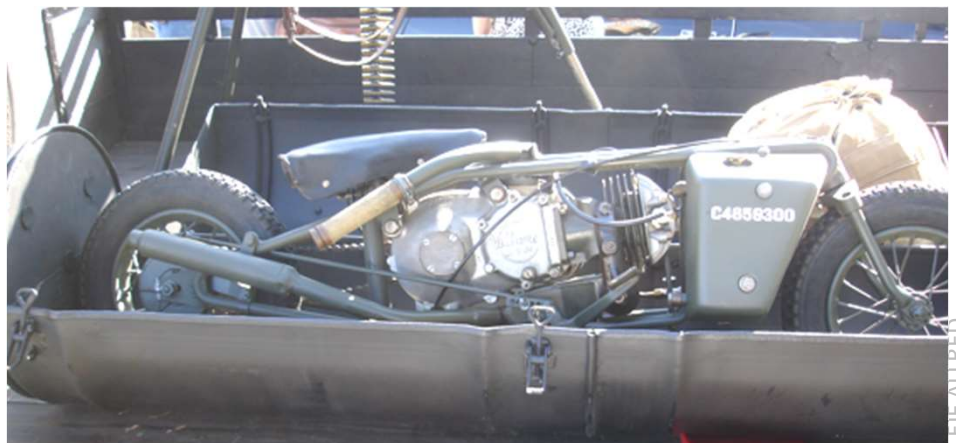
1943 British Welbike Mark I – more on this later . . .