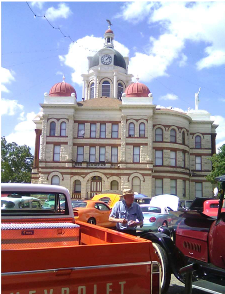
George Pierce – Gatesville, TX – Spurfest September 21, 2024

The friends you made in middle school that you hung with throughout high school and beyond . . . do you know what solidified that bond? It was “The Sleepover.” College and work created a different type of relationship. That’s called “Trauma Bonding” as you had a shared chore or task. The sleepover, however, is sustained interaction even when you’re tired or too exhausted to think it is still fun. It also may be three grown men piling into the single cab of a truck to go to a local homecoming football game and then waking up to rich burning exhaust and pulling antique cars out of trailers and hoping having left the fuel pump on all day didn’t kill the battery. Sitting in an assigned seat over a plate of catfish for an hour just really doesn’t provide the rich and lasting relationship as does the sleepover. It’s sitting out by the tepid 3-foot deep wading pool behind a Comfort Inn with an empty cattle trailer wafting in the breeze and watching TxDOT workers unload a truck that does.