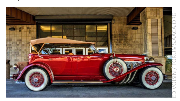
1932 Duesenberg, J Model Murphy Dual Cowl Phaeton

• "Those outside exhaust pipes are fake." – Said a man to his wife as I parked my Auburn at a show. The guy quickly touched one, and I think I heard a sizzle before a cuss word as he pulled back a burned finger. I've heard the same "fake" comment about the external pipes on my '36 Cord, and earlier my now-sold '32 Duesenberg. At shows I've had to caution dozens of people not to touch the pipes until they cooled off.