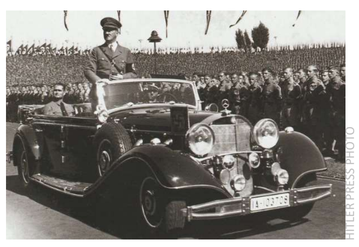
1936 Mercedes Benz 540K

So that's an initial offering of a few of my favorites. Many of you have undoubtedly heard your share of tall tales. Let us know – we'll add them in to future issues.