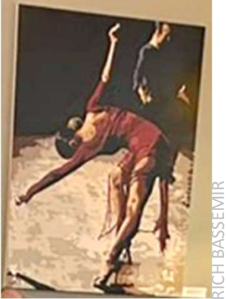
Artwork on display and for sale . . . the artist claims he himself does not dance