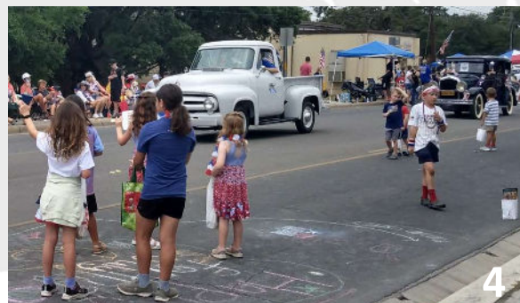
DJ STAMP 2023