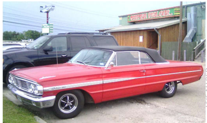
Outside: Member's 1964 Ford Galaxie 500

Adjourn The meeting adjourned shortly after 7:49pm.