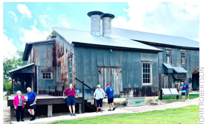
Zedler Mill Museum