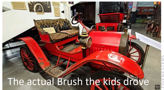
The actual Brush the kids drove