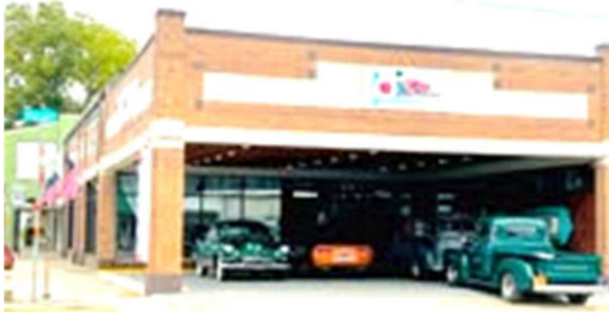
Cappleman Cars – Luling, TX

→ Leaving the Mill, we continued our caravan through a residential neighborhood of downtown Luling to the Cappleman Cars Museum.