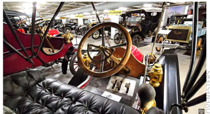
The Antique Car Museum of Iowa