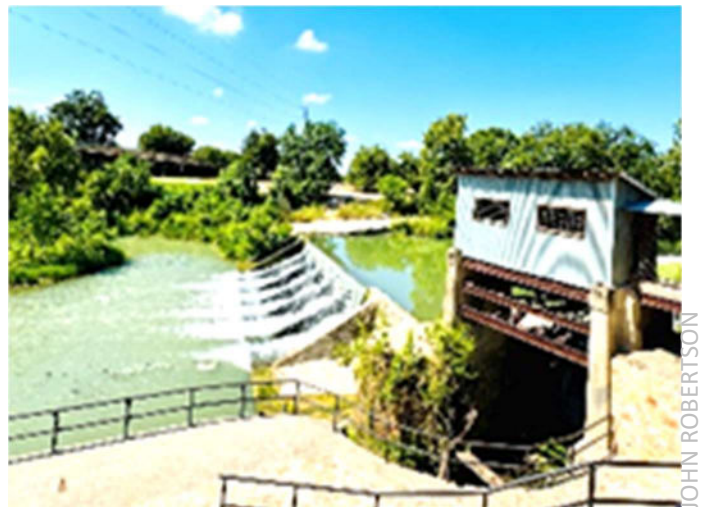
Zedler Mill Museum – Luling, TX