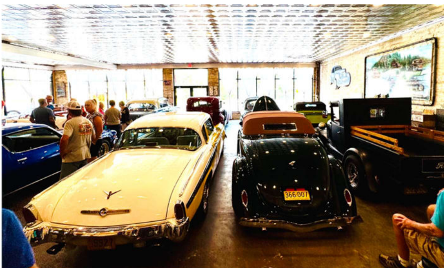
Cappleman Cars – Luling, TX