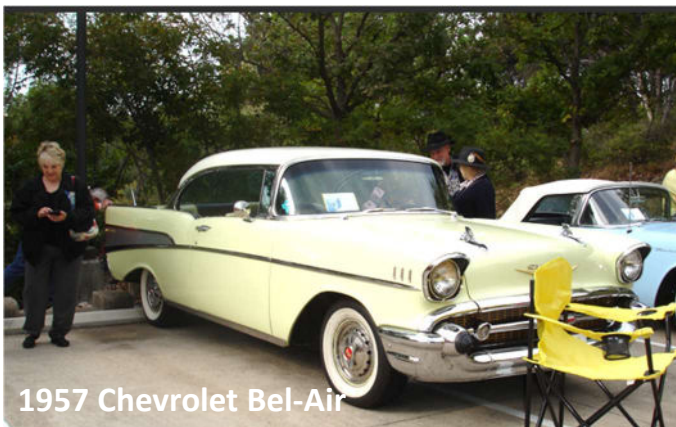
1957 Chevrolet Bel-Air