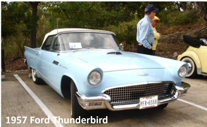
1957 Ford Thunderbird