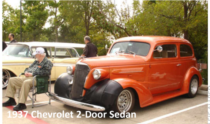
1937 Chevrolet 2-Door Sedan