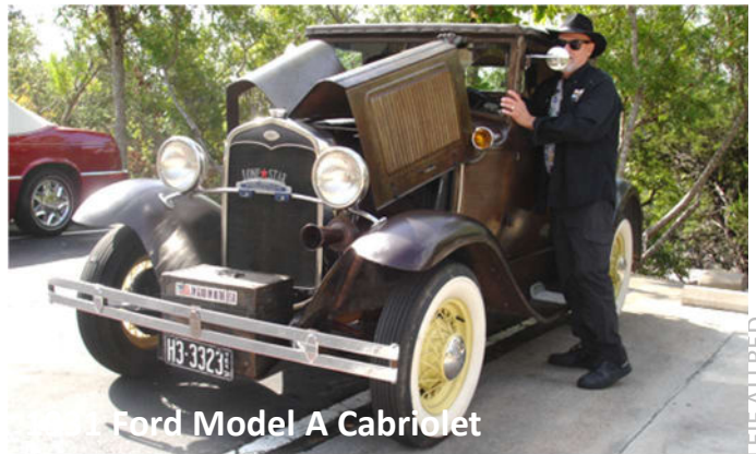
1931 Ford Model A Cabriolet