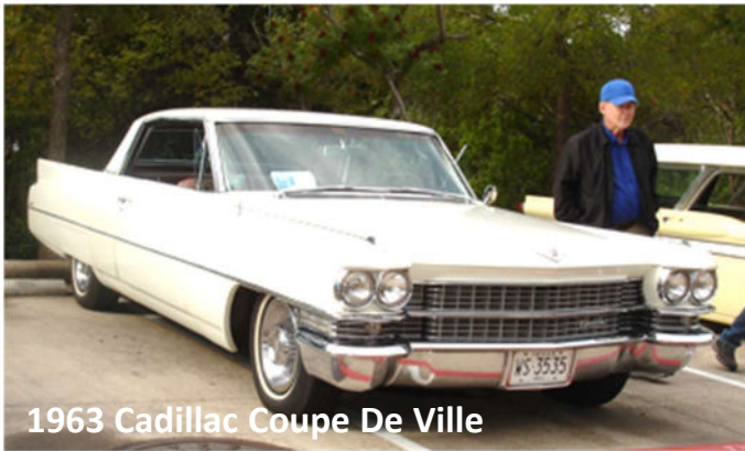
1963 Cadillac Coupe De Ville