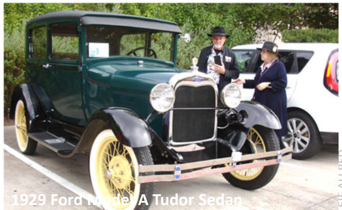
1929 Ford Model A Tudor Sedan