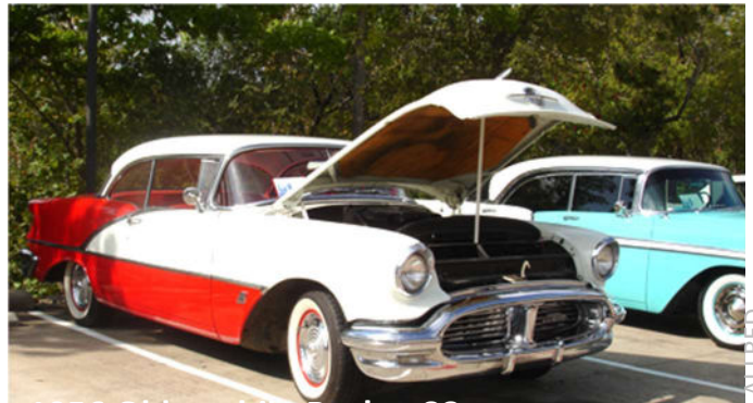
1956 Oldsmobile Rocket 88