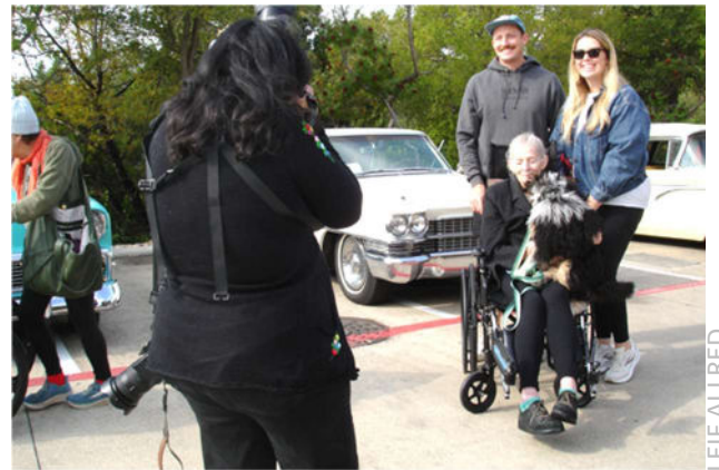
The Photographer, Families, and Pets