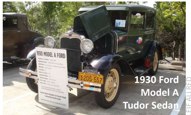
Statistics of the Model A Ford