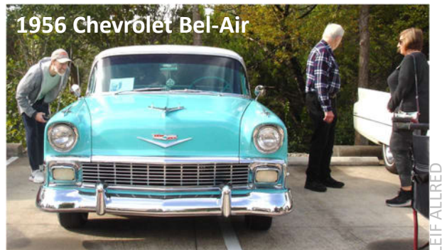
Other reasons to take up two spots