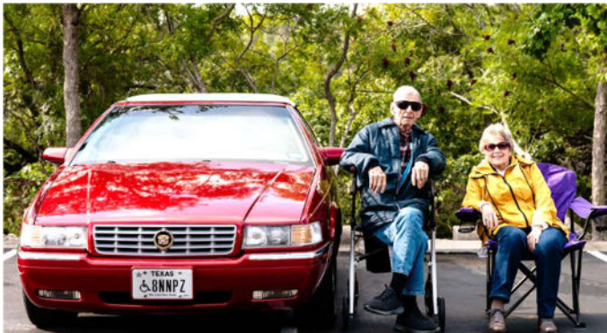
2000 Cadillac Eldorado ESC Convertible