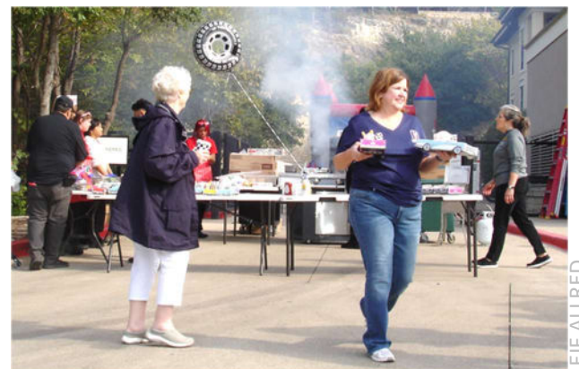
Outdoor grilling and Bouncy House