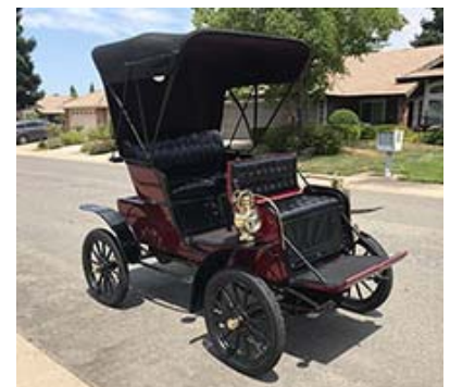
1904 Stevens-Duryea 4 Passenger Runabout