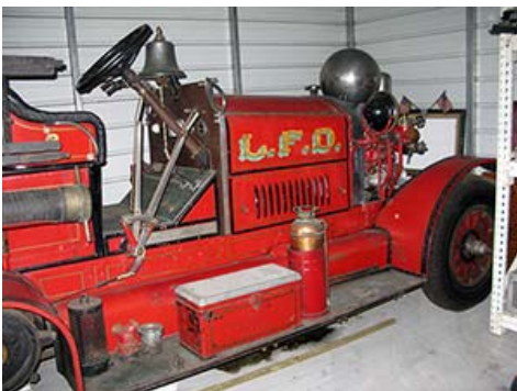
1921 Ahrens-Fox Fire Engine IK4

https://www.hcca.org/classifieds.php?cars