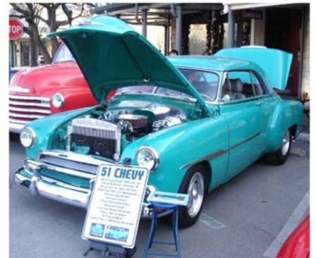
Pistons On The Square – Georgetown, TX – January 16, 2021