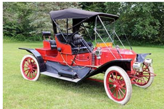
1911 Stanley Model 61 Roadster