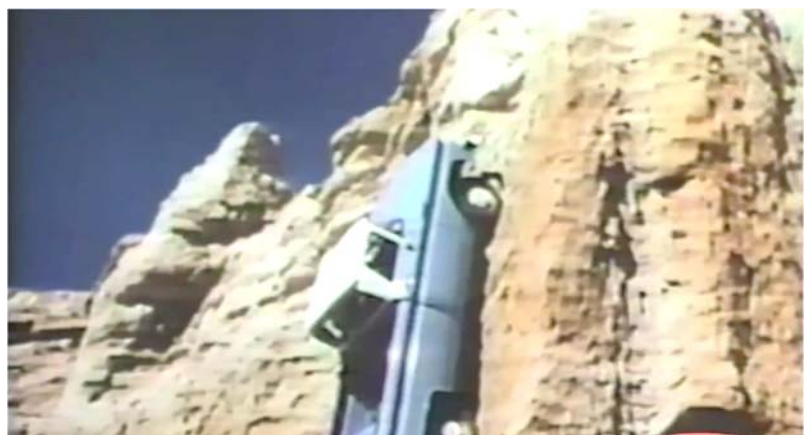
Virtual Zoom Meeting Program – 1/12/2021