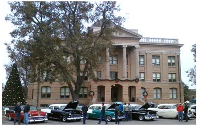
Pistons on the Square – Downtown Georgetown, TX – November 20, 2021

More trucks than tacos at this 3 year old monthly event that used to be at Masfajitas on Williams Drive and has moved to Hardtails (biker hangout and music venue) on I-35 in Georgetown, TX. Although this gathering is mostly a demonstration and information on how to do an LS engine swap to make a truck faster than a Corvette (it is still a truck, mind you), many of the participants own shops including an interiors place in Weir, TX and a collision repair in Georgetown. There's a wealth of knowledge out there but it takes some networking to tap into it. 🚗