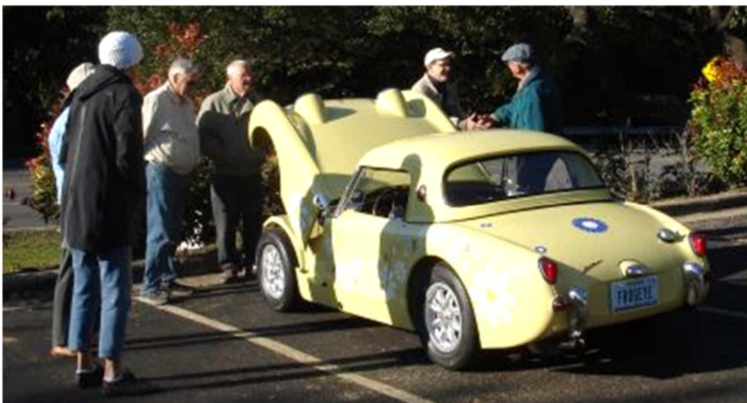
The Pre-Show Gathering – November 6, 2021 – West Lake Hills, TX