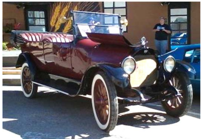
Main Street Car Show – Taylor, TX – October 30, 2021