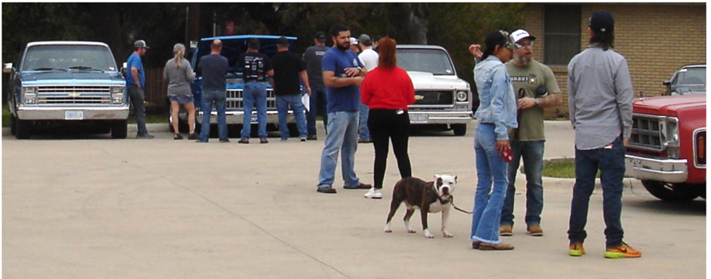
Trucks and Tacos – Hardtails in Georgetown, TX – November 21, 2021

More trucks than tacos at this 3 year old monthly event that used to be at Masfajitas on Williams Drive and has moved to Hardtails (biker hangout and music venue) on I-35 in Georgetown, TX. Although this gathering is mostly a demonstration and information on how to do an LS engine swap to make a truck faster than a Corvette (it is still a truck, mind you), many of the participants own shops including an interiors place in Weir, TX and a collision repair in Georgetown. There's a wealth of knowledge out there but it takes some networking to tap into it. 🚗