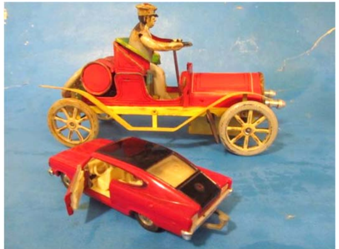
Rambler Marlin in 1/43 Scale