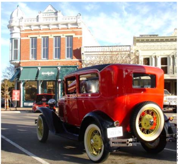
Georgetown, TX – 2/19/2022

It was another cold morning at Pistons on the Square when my car that has a heater also had a sluggish battery. Next in line was the 1931 Ford – mostly because it was clean. Even after the 23-mile drive, I could still see my breath inside the car. The Model A, however, gets way more attention thus I stayed nearby talking to my neighbors and making new friends. Little children got to sit in the car – except that boy that wouldn't put away his electronic mother (grandma's phone) – including two early teen girls who were ecstatic pretending they were moonshiners. This event is such an easy way to meet up with other car enthusiast – it's all the club benefits without bylaws, dues, or responsibility!