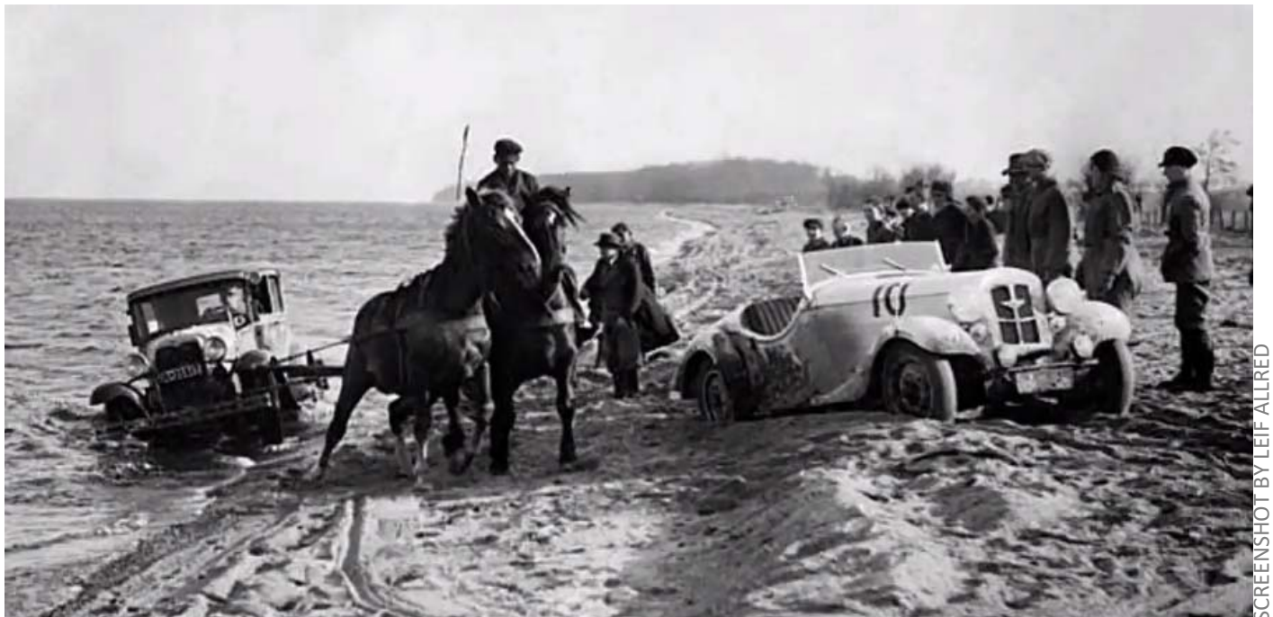
Early Tow Vehicle – 2 Horsepower

4/28/2022 Fort Worth, TX Pate Swap Meet at Texas Motor Speedway →