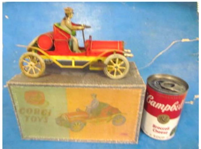
Corgi Toys in Original Box – Soup Not Included