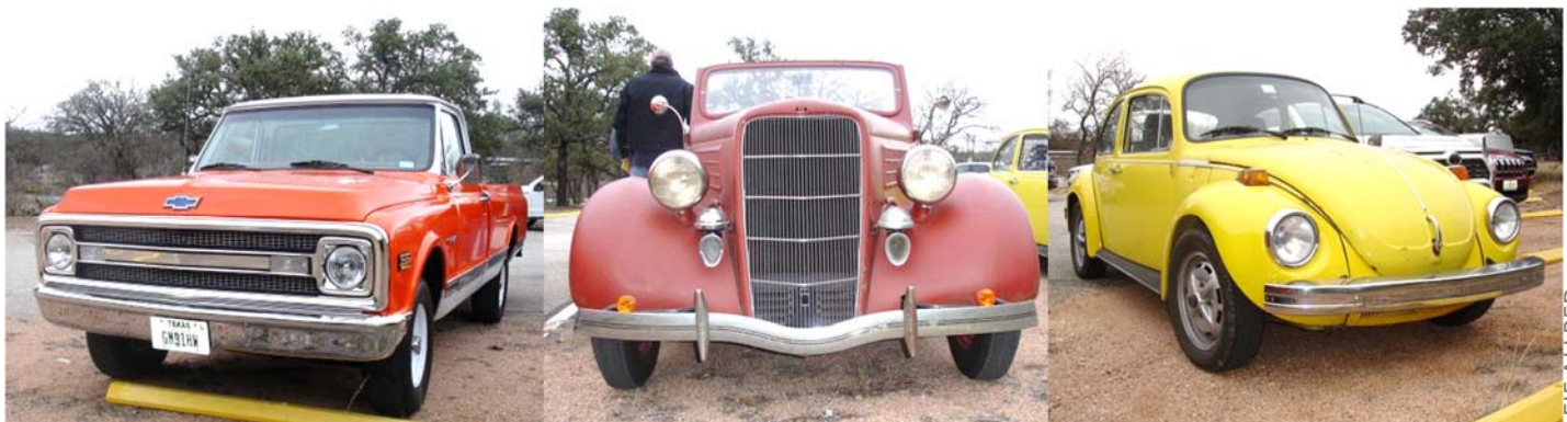
Temperature Control: On and Off; Too Cold; Too Cold or Roast Your Feet