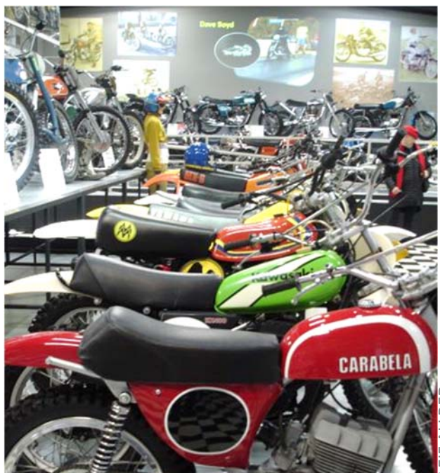
Hill Country Motorheads – Burnet, TX