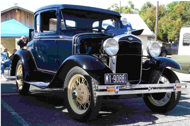
1931 Ford Model A – in family since 1934

Held at The Hall on FM 2268 in Holland – which is a great venue for a party, live music, bingo or outdoor wedding. The show was hosted by the Holland American Legion Post 526 as a fundraiser for scholarships they offer. It had great community involvement.