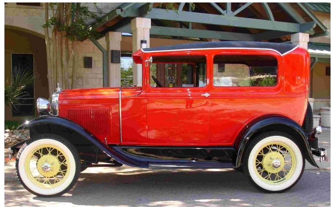
1931 Ford Model A – Tudor Sedan