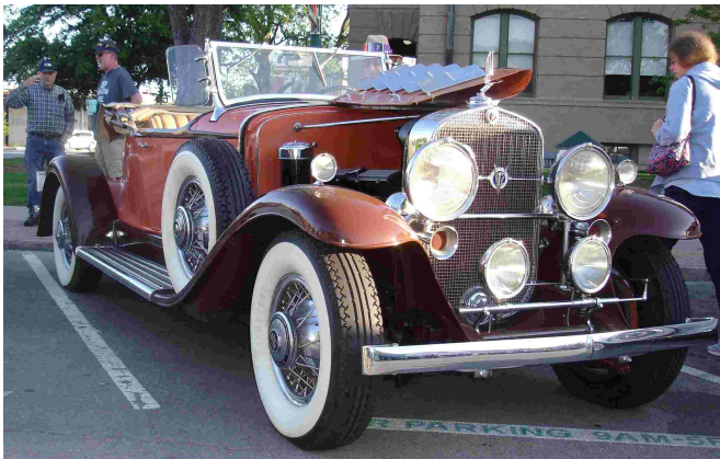
1931 Cadillac Boattail Convertible

What's better than seeing a 1931 Cadillac Boattail at a local cruise-in? Following it to the event and being able to tell just how difficult it is to drive it at slow speeds. The owner had to give it his all to park the V12 and use his arm to signal in such a luxurious vehicle.