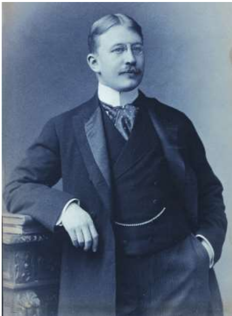
Dr. Horatio Nelson Jackson