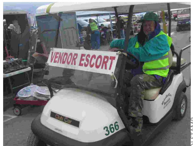
Sharing Duties – Escort and Parts Hauling