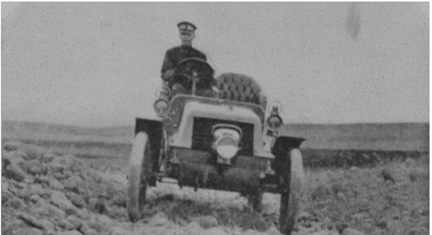
The Car: The 1903 Winton had a two-cylinder, 20-horsepower engine directly underneath the driver's seat, chain drive, capable of speeds up to 30 mph; two speeds forward and one reverse