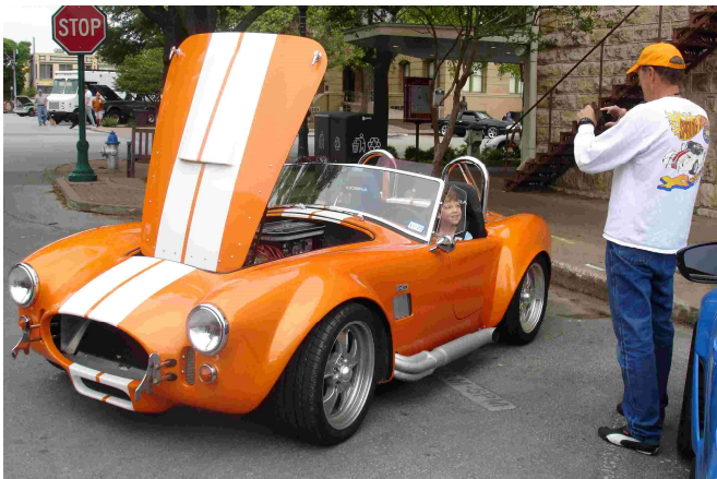
1965 Cobra – Young Car Enthusiast