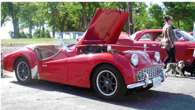
1959 Triumph Spitfire – Dog Approved