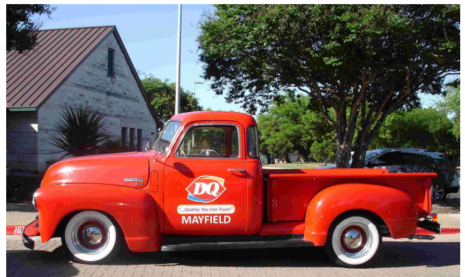
1955 Chevrolet "Dairy Queen" Pick-up