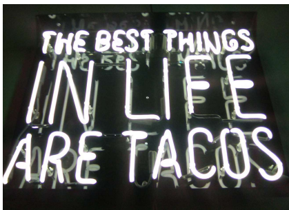
Fuzzy's Tacos – Decatur, TX

Having just returned from Pate Swap Meet, the amount of work our clubs puts into this is quite outstanding and much of it is without enough notice or recognition – of which I want to remedy. I spend all of my time on the cart hauling parts making it back hospitality for a quick lunch and little breaks for water and cookies (my favorite this year were the homemade oatmeal and brown sugar, peanut butter, and sugar cookies). When I arrive on Thursday morning, the trailer and club site is set up, many are preparing lunch, and logistics fires have already been extinguished.