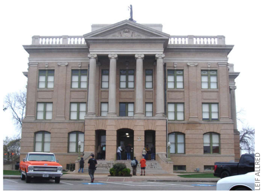
Photographers swarm as the skies grew darker

There was plenty of space to park – even after 8am – which is an anomaly for this monthly gettogether. Many people use this opportunity to pass out flyers for upcoming car shows which is how I got notification of the Holland, TX VFW fundraiser on 4/13/2024. You should go. There's booths and food and cars and it wraps up before noon so that you can get on with your weekend.