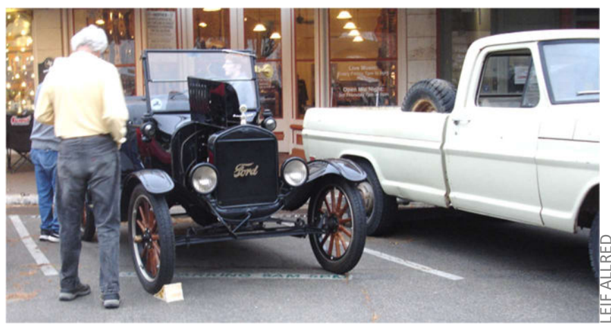
1924 Model T Ford and low mileage Ford farm truck