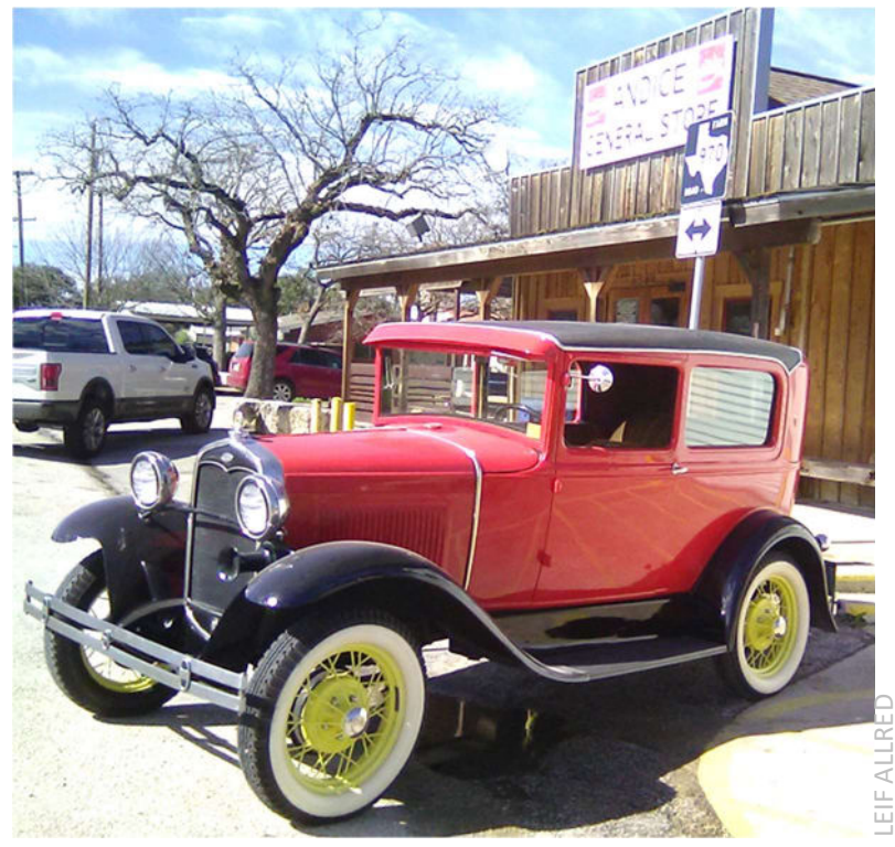
February 3, 2024 - Andice, TX

People ask me if this car still exists. Yes, and it is very reliable. Here's a picture for proof. It just doesn't go very far away from its home and that's it is slow largely because uncomfortable. It did once make it to Fayetteville where, at some point, I was looking for a place to put my leg and the running board seemed the obvious location. I come across some people who have modified their Model A Ford vehicle: adding overdrive, high compression heads, hydraulic brakes, wider tires, and tube gas shocks. Why don't you just install a V8 and get it over with?!? If I want to go fast and be comfortable, I'll drive my BMW. That's the beauty of AACA . . . driving them like they were intended.