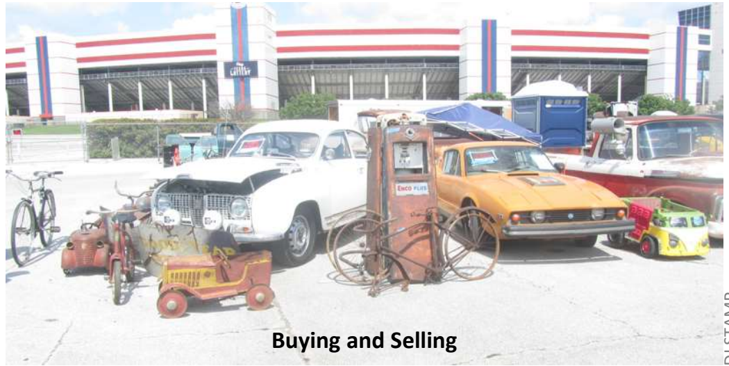
Buying and Selling