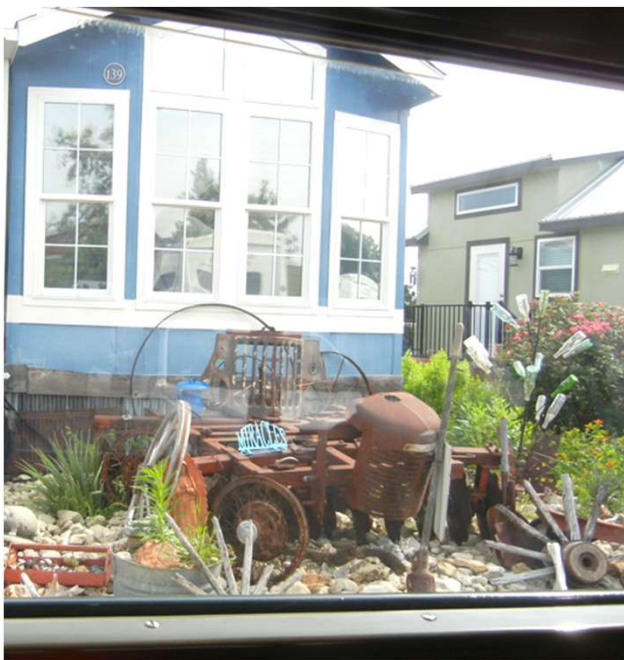
Mobile Loaves & Fishes – Community First! Village – May 11, 2024