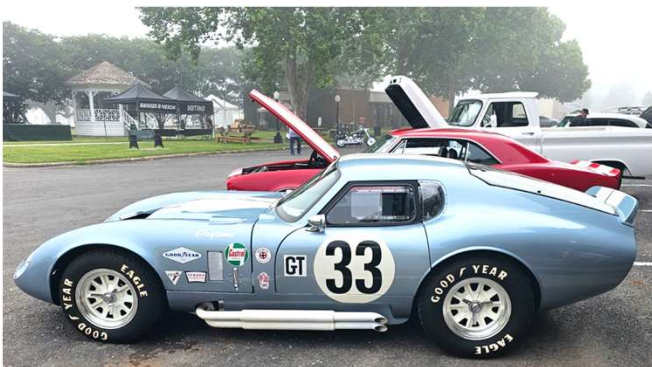
1965 Factory Five Daytona (debut): Best of Show Modified and Best Hot Rod