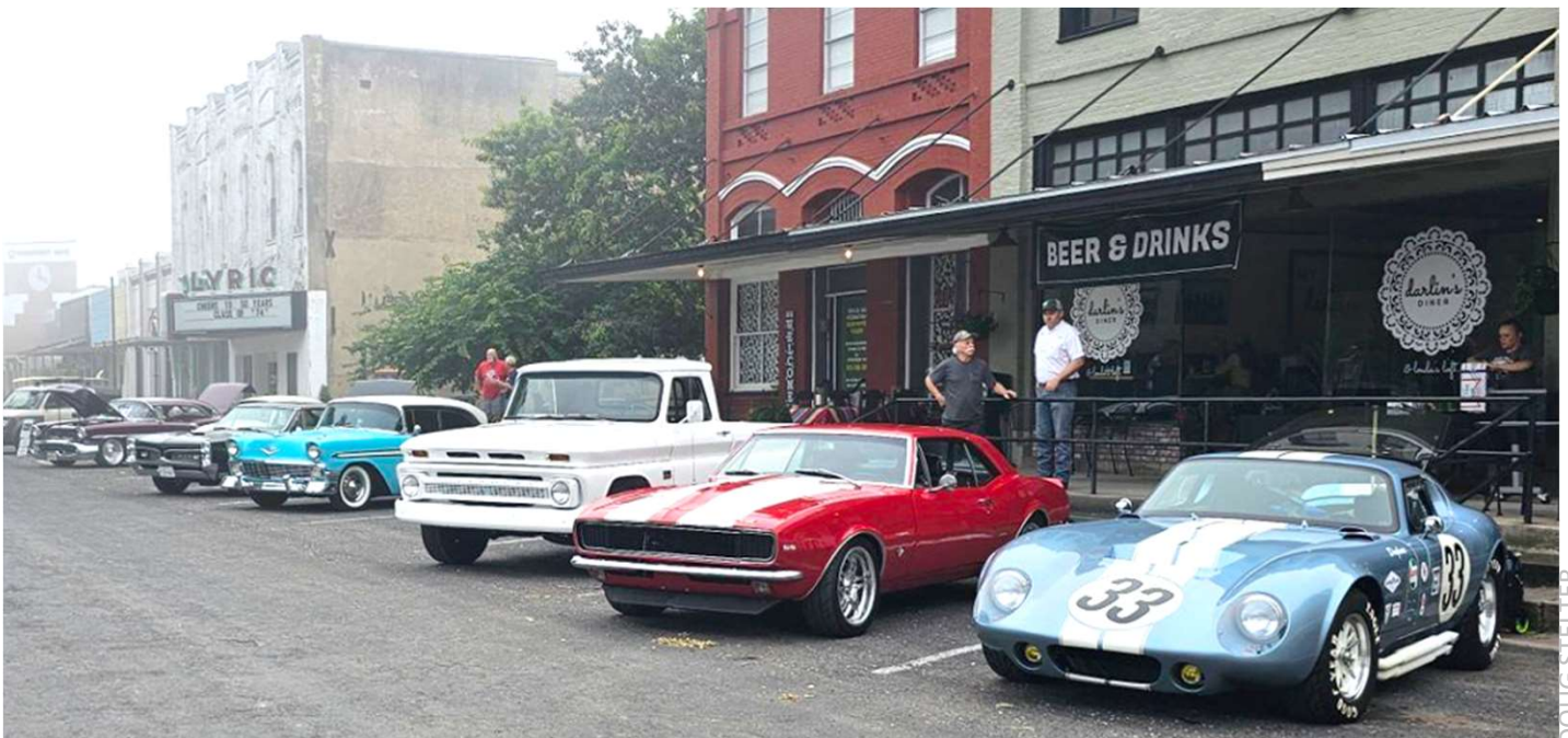
Muffins and Mufflers – Flatonia, TX – May 18, 2024