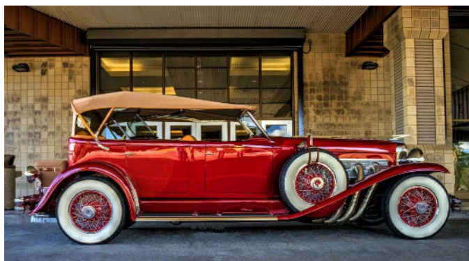
1932 Duesenberg, J Model Murphy Dual Cowl Phaeton

• “Those outside exhaust pipes are fake.” – Said a man to his wife as I parked my Auburn at a show. The guy quickly touched one, and I think I heard a sizzle before a cuss word as he pulled back a burned finger. I’ve heard the same “fake” comment about the external pipes on my ’36 Cord, and earlier my now-sold ’32 Duesenberg. At shows I’ve had to caution dozens of people not to touch the pipes until they cooled off.