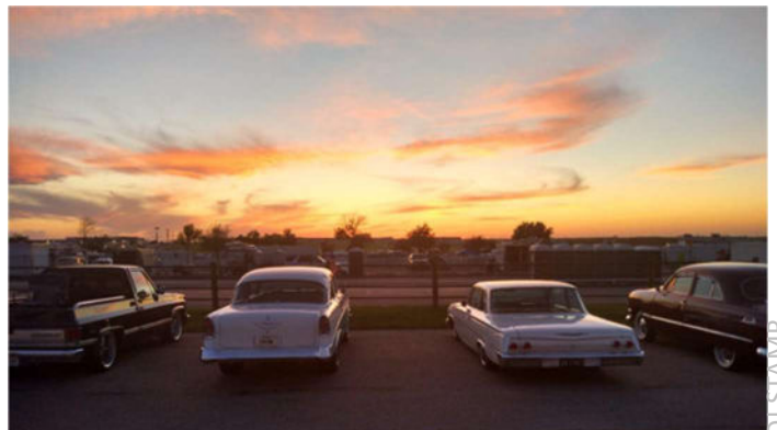
Hospitality – Lunch, Snacks, and Chillax