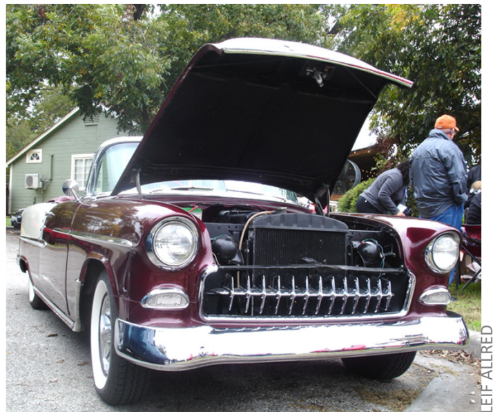
1955 Chevrolet Bel-Air Convertible Expertly restored by its owner from the ashes of the 2011 Bastrop Fires

So what's it going to take to get YOU to get a new member? It's YOUR club, it's up to you to make it grow and prosper! It is the responsibility of every member. Got any other ideas on how to grow the club? Contact me or any board member! We all would love to hear what YOU think!