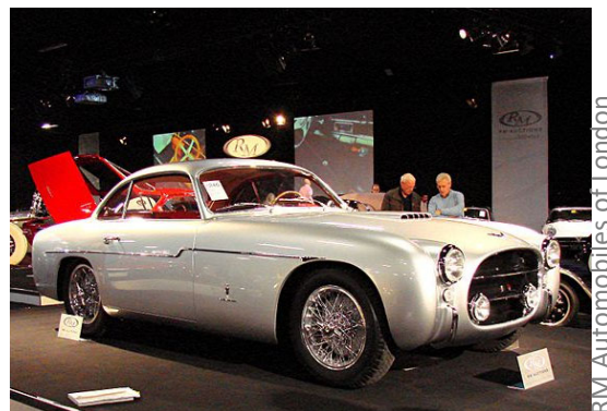
R/V Automobiles of London

The only non-Supersonic Fiat 8V bodied by Ghia