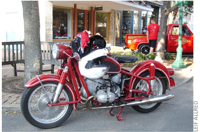
Georgetown, TX – 8/19/2023