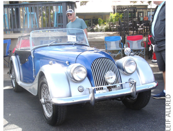
1964 Morgan – 10/7/2023