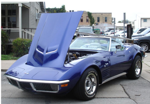
Bastrop, TX – November 11, 2023 windows rolled up in case it rains