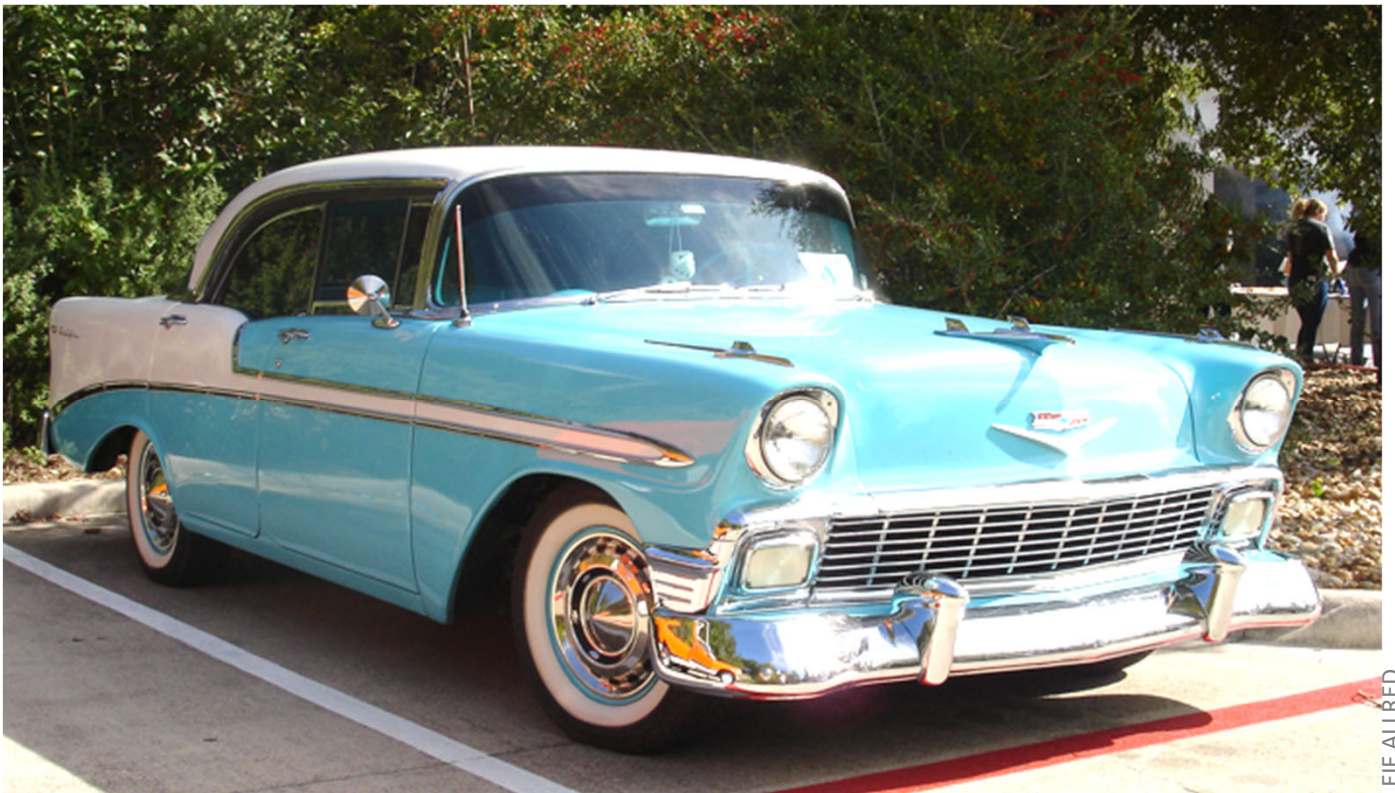
1956 Chevrolet Bel-Air 4-Door Hardtop – Austin, TX – November 4, 2023

It is quite amazing the impact antique cars have on people of all ages. Only 67 years ago, it was just a mode of transportation – with individual style and personality.