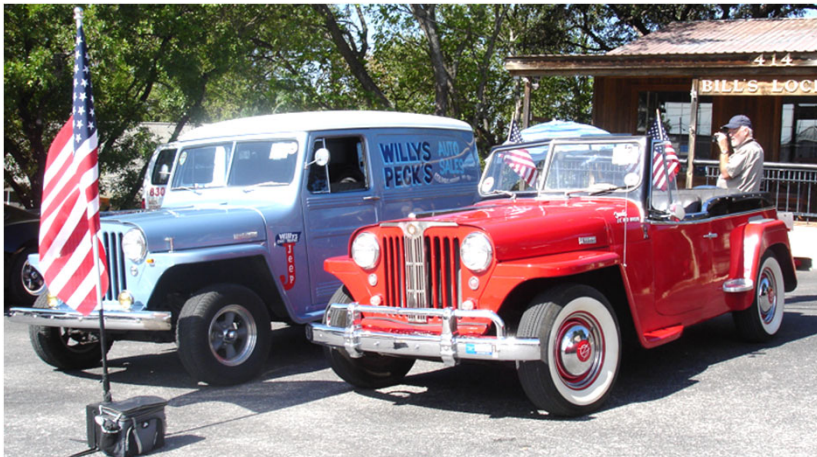
Willys Pair (red is 1948) – Hutto, TX – 10/14/2023