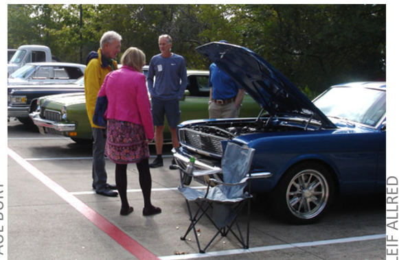
The Road Relics and Belmont Village Senior Living – West Lake Hills, TX