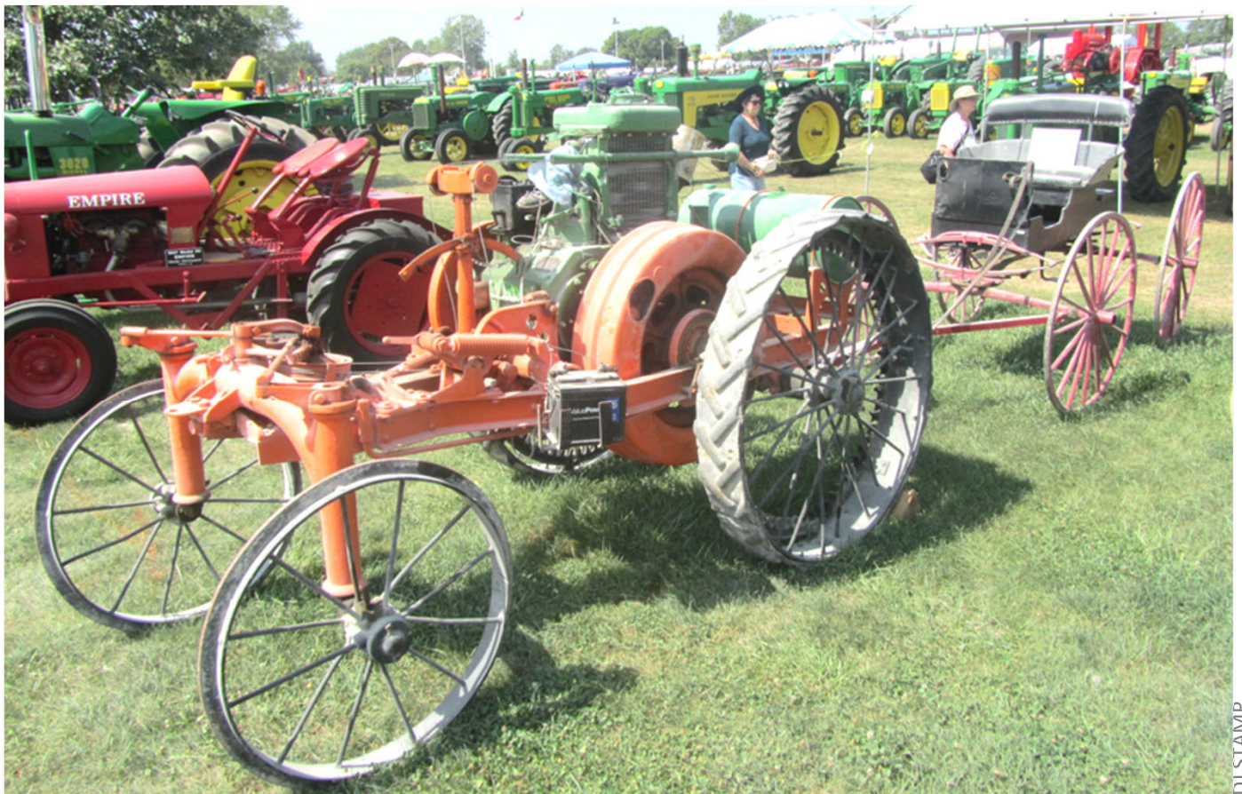
Horseless Carriage – the orange contraption is controlled by reins from the pink buggy