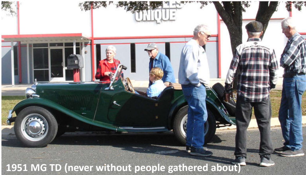
1951 MG TD (never without people gathered about)