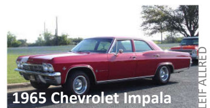
1965 Chevrolet Impala