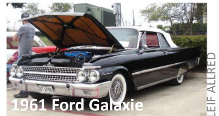
1961 Ford Galaxie