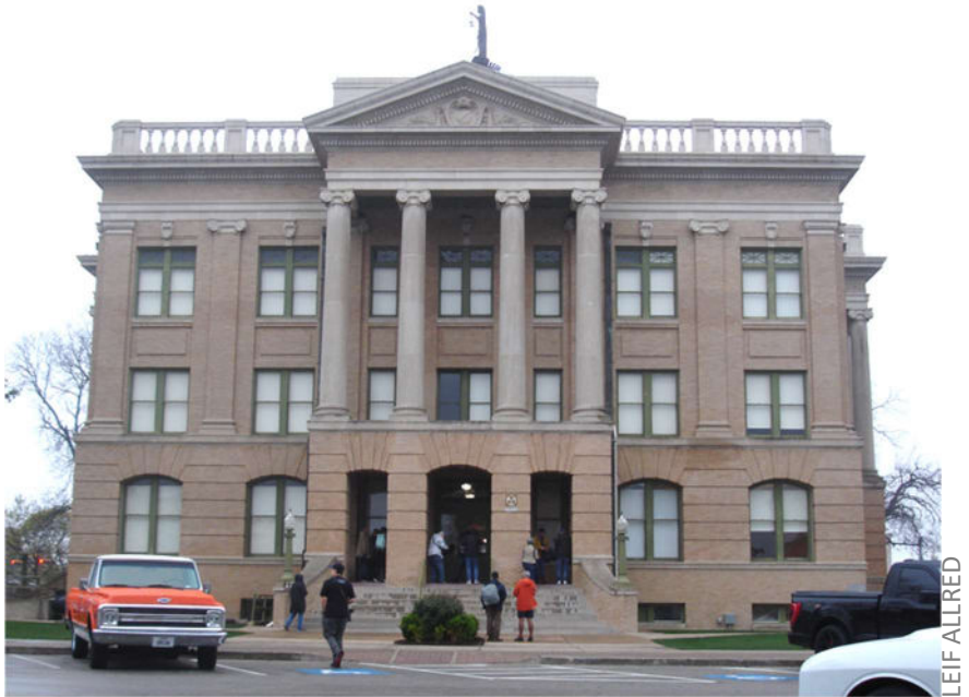
Photographers swarm as the skies grew darker

There was plenty of space to park – even after 8am – which is an anomaly for this monthly get-together. Many people use this opportunity to pass out flyers for upcoming car shows which is how I got notification of the Holland, TX VFW fundraiser on 4/13/2024. You should go. There's booths and food and cars and it wraps up before noon so that you can get on with your weekend.