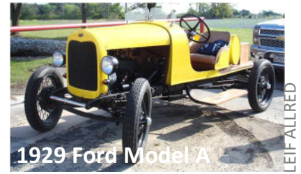
1929 Ford Model A

After we finished, we went to the Monument Café in Georgetown for lunch and were seated immediately although it was packed and had an obvious wait with people hanging around outside. Even parking was in overflow across the street. They have good food, and we had a great time sharing stories. Looking forward to our next meeting and Pate is just around the corner. →