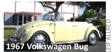
1967 Volkswagen Bug