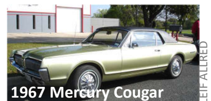
1967 Mercury Cougar