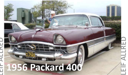
1956 Packard 400