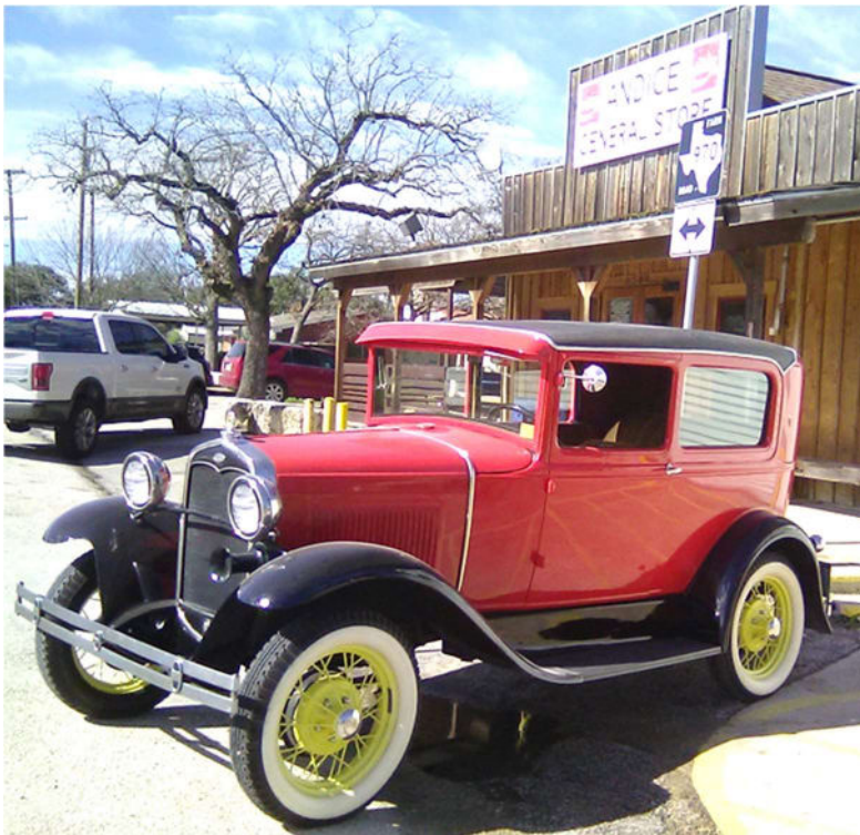
February 3, 2024 – Andice, TX

People ask me if this car still exists. Yes, and it is very reliable. Here's a picture for proof. It just doesn't go very far away from its home and that's largely because it is slow and uncomfortable. It did once make it to Fayetteville where, at some point, I was looking for a place to put my leg and the running board seemed the obvious location. I come across some people who have modified their Model A Ford vehicle: adding overdrive, high compression heads, hydraulic brakes, wider tires, and tube gas shocks. Why don't you just install a V8 and get it over with?!? If I want to go fast and be comfortable, I'll drive my BMW. That's the beauty of AACA . . . driving them like they were intended.