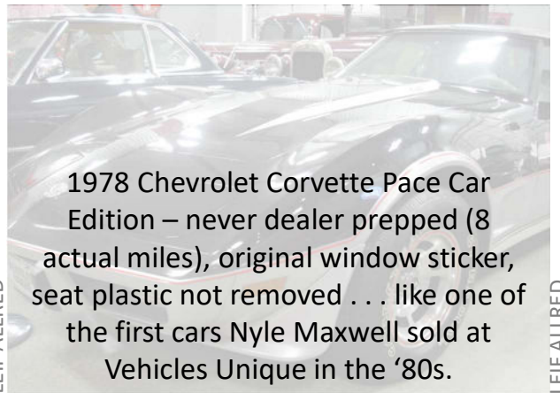
1978 Chevrolet Corvette Pace Car Edition – never dealer prepped (8 actual miles), original window sticker, seat plastic not removed . . . like one of the first cars Nyle Maxwell sold at Vehicles Unique in the '80s.