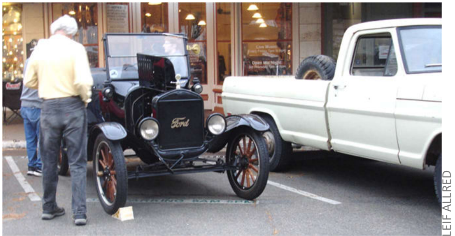
1924 Model T Ford and low mileage Ford farm truck